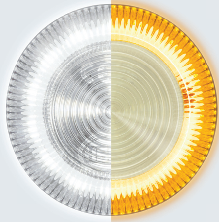
White working light